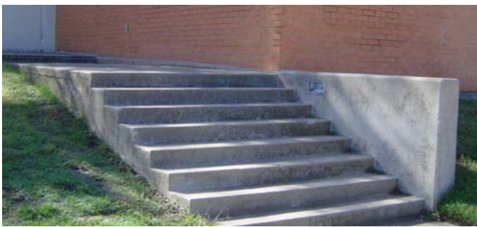
This photo is an example of exterior steps that are in good condition; however, the stairs have more than four risers, so they should be equipped with an appropriate handrail.