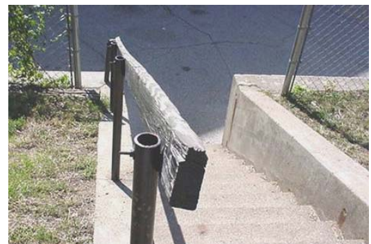
This photo is an example of an inadequate handrail in terms of design. The handrail has poor grasp ability, sharp corners and protruding bolts holding the handrail to the support posts.