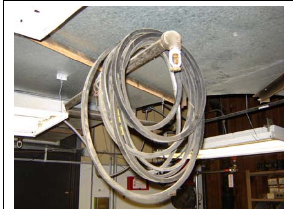
This photo is an example of items that are being hung from the sprinkler piping. This practice would change the spray pattern and possibly cause damage to the sprinkler head.