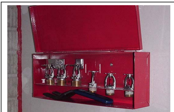
This photo is an example of a cabinet for the storage of spare sprinkler heads and a wrench.

To better protect your church against fires and to reduce the possibility of a disruption to your ministry from fire or smoke damage, sprinkler systems are a "must have." By following the tips and recommendations on this fact sheet, your church will be in better prepared to reduce damages from a fire.